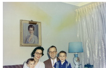
Yellowing caused by envelope adhesive