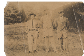
Embrittlement caused by acids