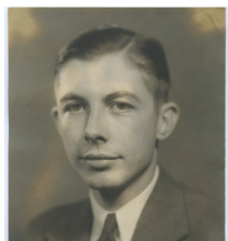
Image fade caused by adhesive