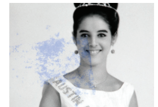
Stain caused by dye in paper stored in contact with the photo