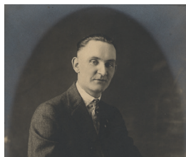
Silver mirroring caused by oval window mat